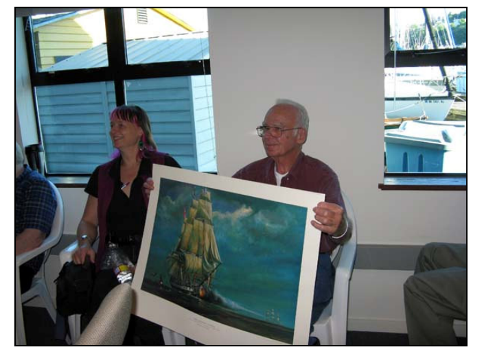
One of the Door Prizes