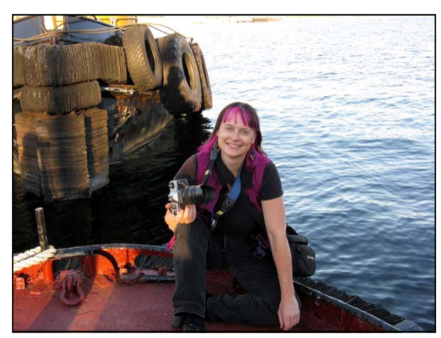
Leslie our contributing photographer this month